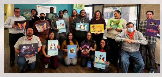
Our Board & Staff with their favorite CCEJ Restorative Belief Posters